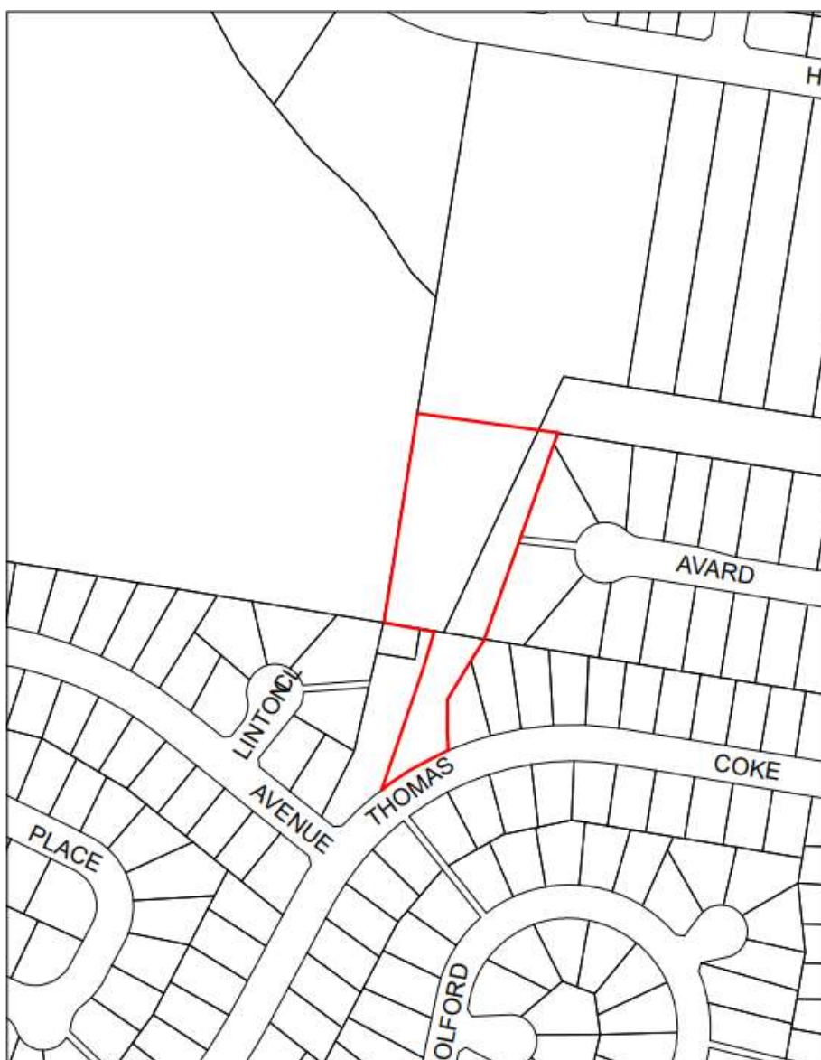
Map 3: Subject Site for item 2 – Access handle to proposed residential subdivision

The proposed access road is subject to a previously approved masterplan from Maitland City Council. The RFS had issued General Terms of Approval (GTA) stating that access is to comply with the Planning for Bushfire Protection 2019 guideline, though there is no specific reference to the requirement for a through road. In their assessment of the development application, the RFS have advised that they “would accept no less than a through access to a minimum of a non-perimeter road standard.”