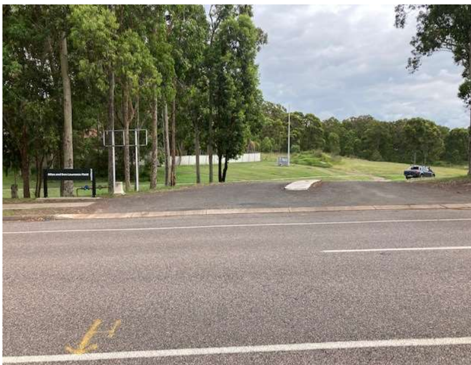
Photo 2: Entry to A & D Lawrence Oval from Thomas Coke Drive, Thornton.